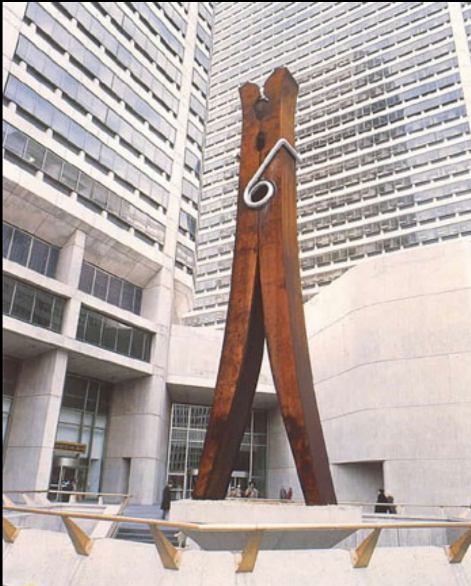
Clothespin, 1976 Cor-Ten and stainless steels Centre Square Plaza, Fifteenth and Market streets, Philadelphia